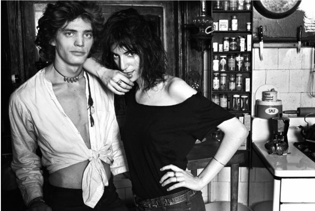
Norman Seeff, Robert Mapplethorpe & Patti Smith, New York, 1969 "Robert & Patti II"