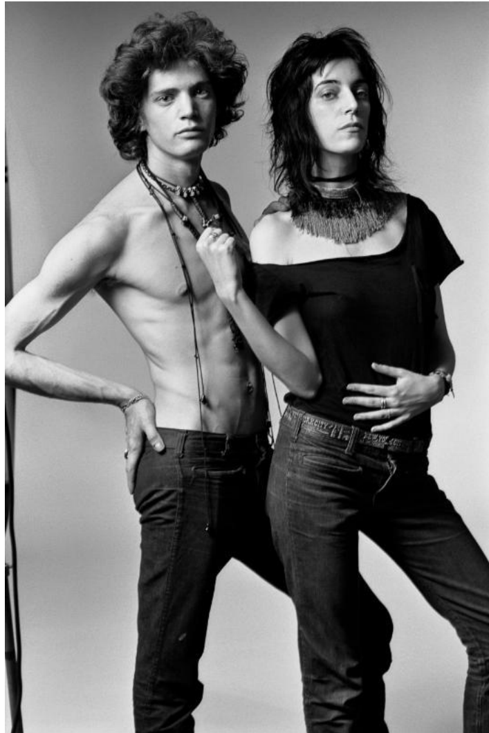
Norman Seeff, Robert Mapplethorpe and Patti Smith, New York, 1969

148 NORTH LA BREA AVENUE LOS ANGELES CA 90036