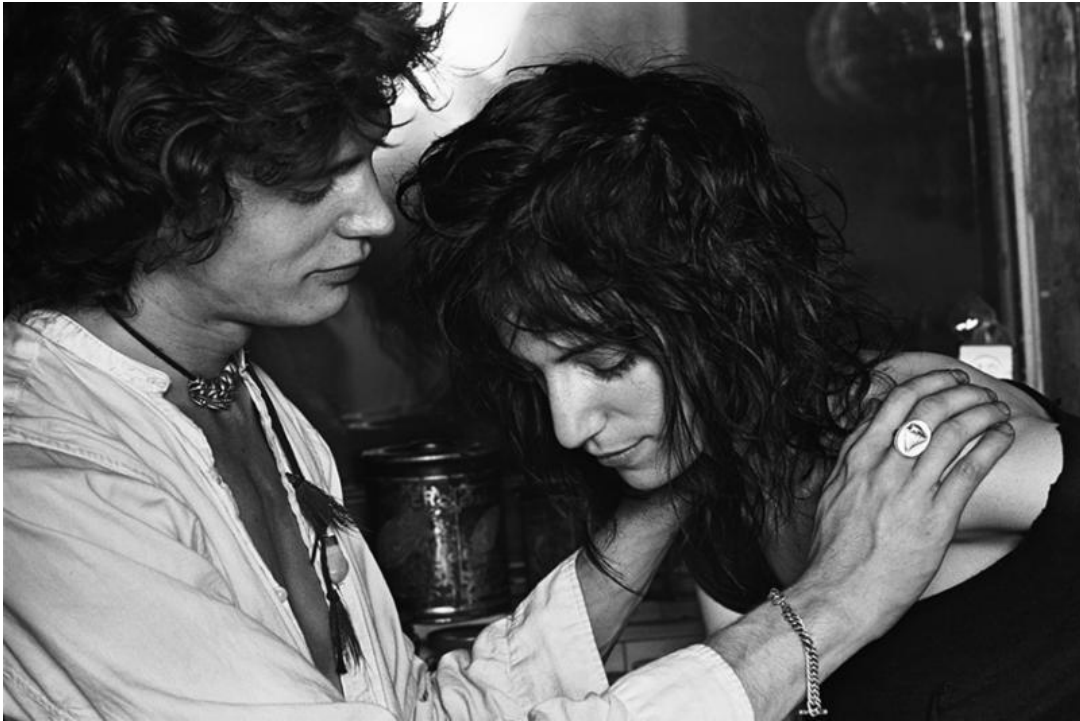
Norman Seeff, Robert Mapplethorpe & Patti Smith, New York, 1969 "Robert & Patti Classic"

148 NORTH LA BREA AVENUE LOS ANGELES CA 90036