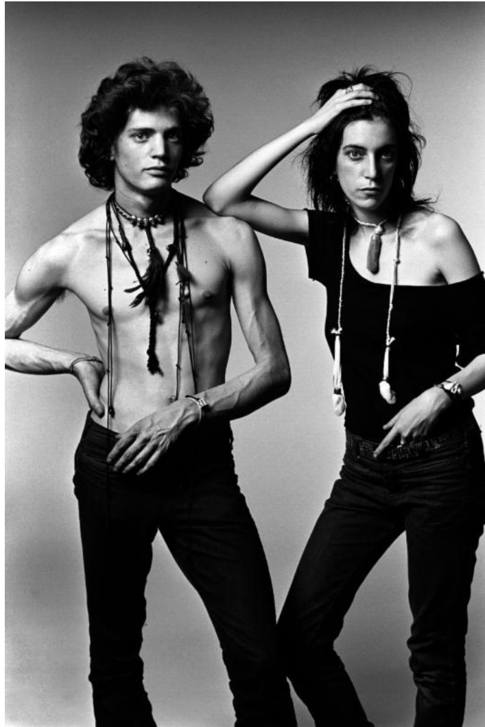
Norman Seeff, Robert Mapplethorpe and Patti Smith II , New York, 1969

All Portraits Above Are Available As Archival Pigment Print, Combined Edition of 50 Signed, titled, dated, numbered verso 15 x 22 inches 28 x 42 inches 40 x 60 inches