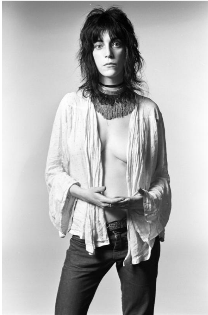
Norman Seeff, Patti Smith, New York, 1969

148 NORTH LA BREA AVENUE LOS ANGELES CA 90036