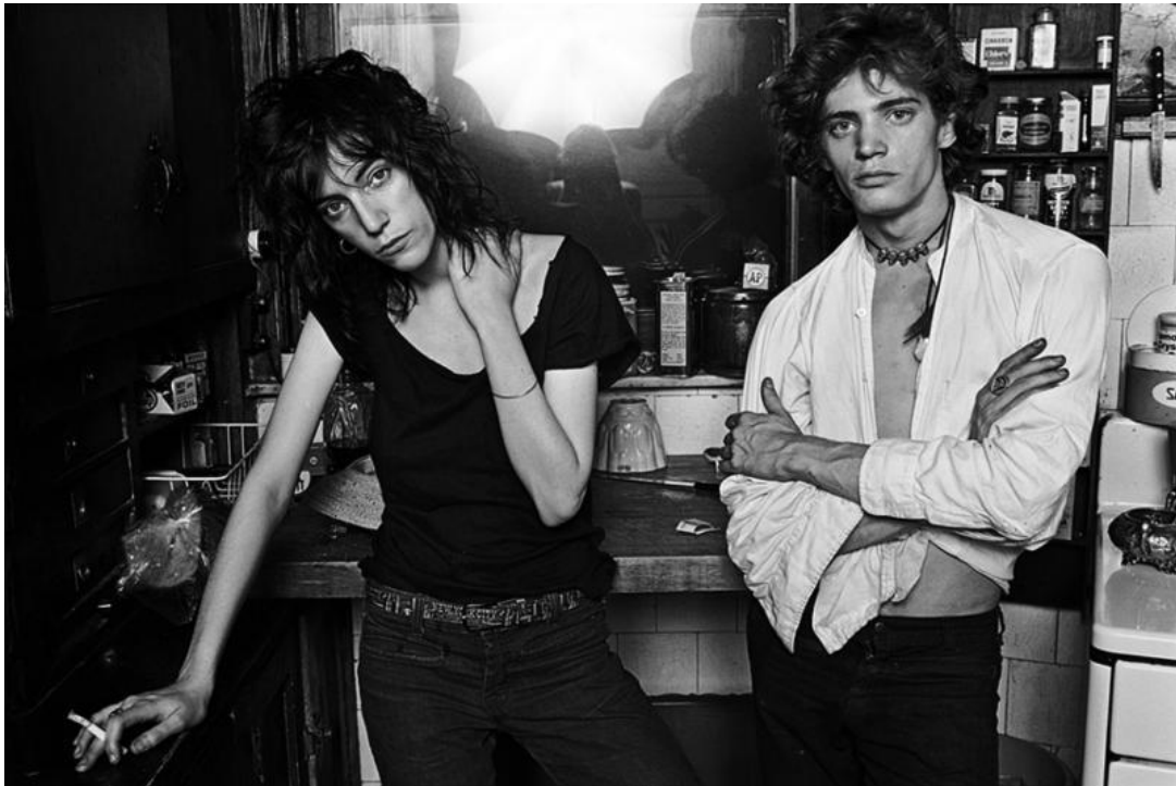
Norman Seeff, Robert Mapplethorpe & Patti Smith, New York, 1969, "Patti with Cigarette"

148 NORTH LA BREA AVENUE LOS ANGELES CA 90036